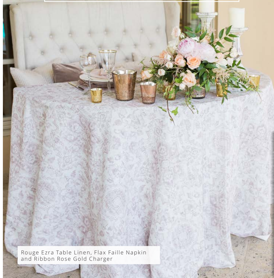
Rouge Ezra Table Linen, Flax Faille Napkin and Ribbon Rose Gold Charger

A perfect romantic table for two is enhanced with varying shades of pink. From deep rose to blush, this antiqued pattern is brought to life with rose gold chargers and sparkling table décor.