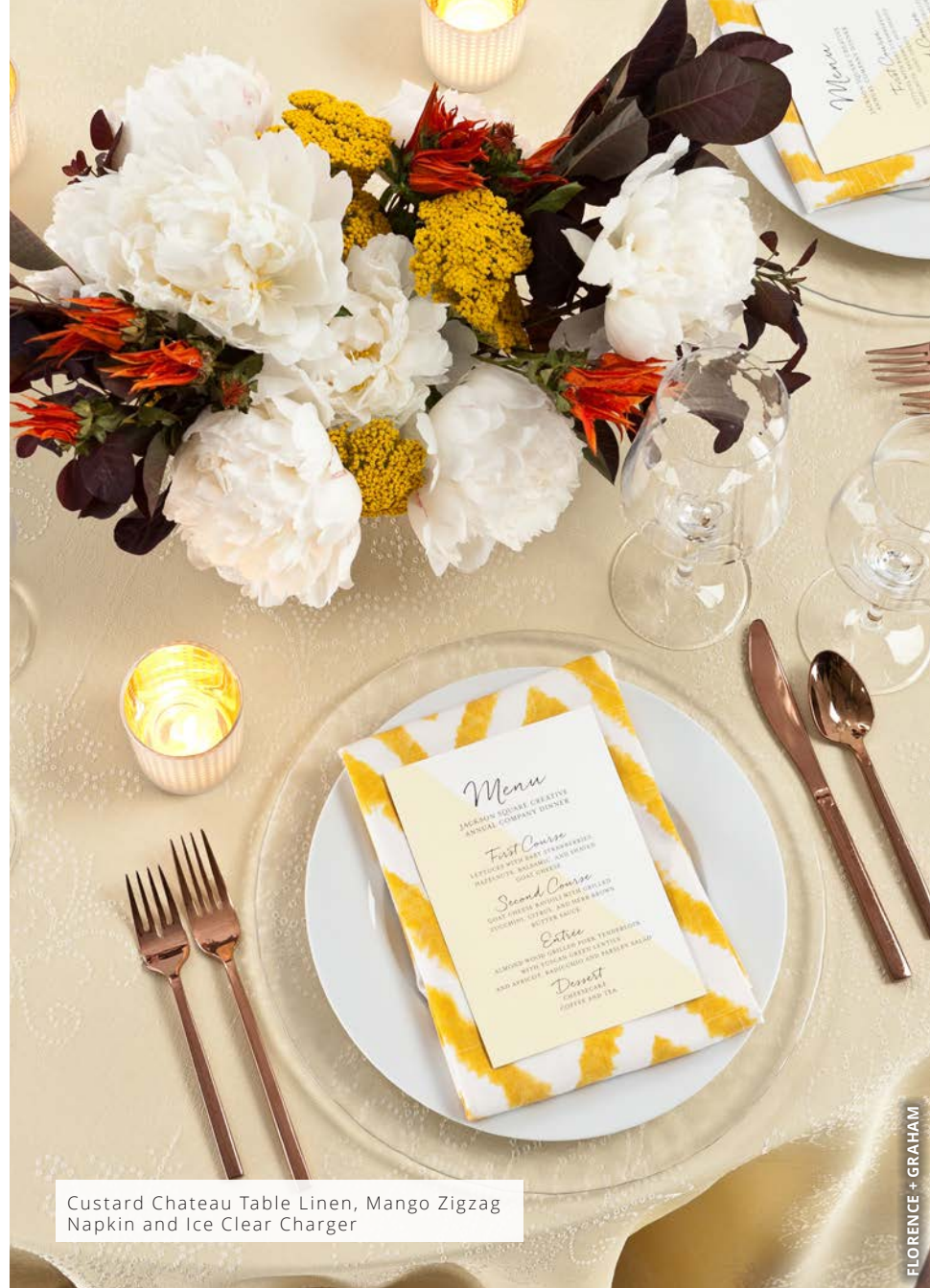
Custard Chateau Table Linen, Mango Zigzag Napkin and Ice Clear Charger