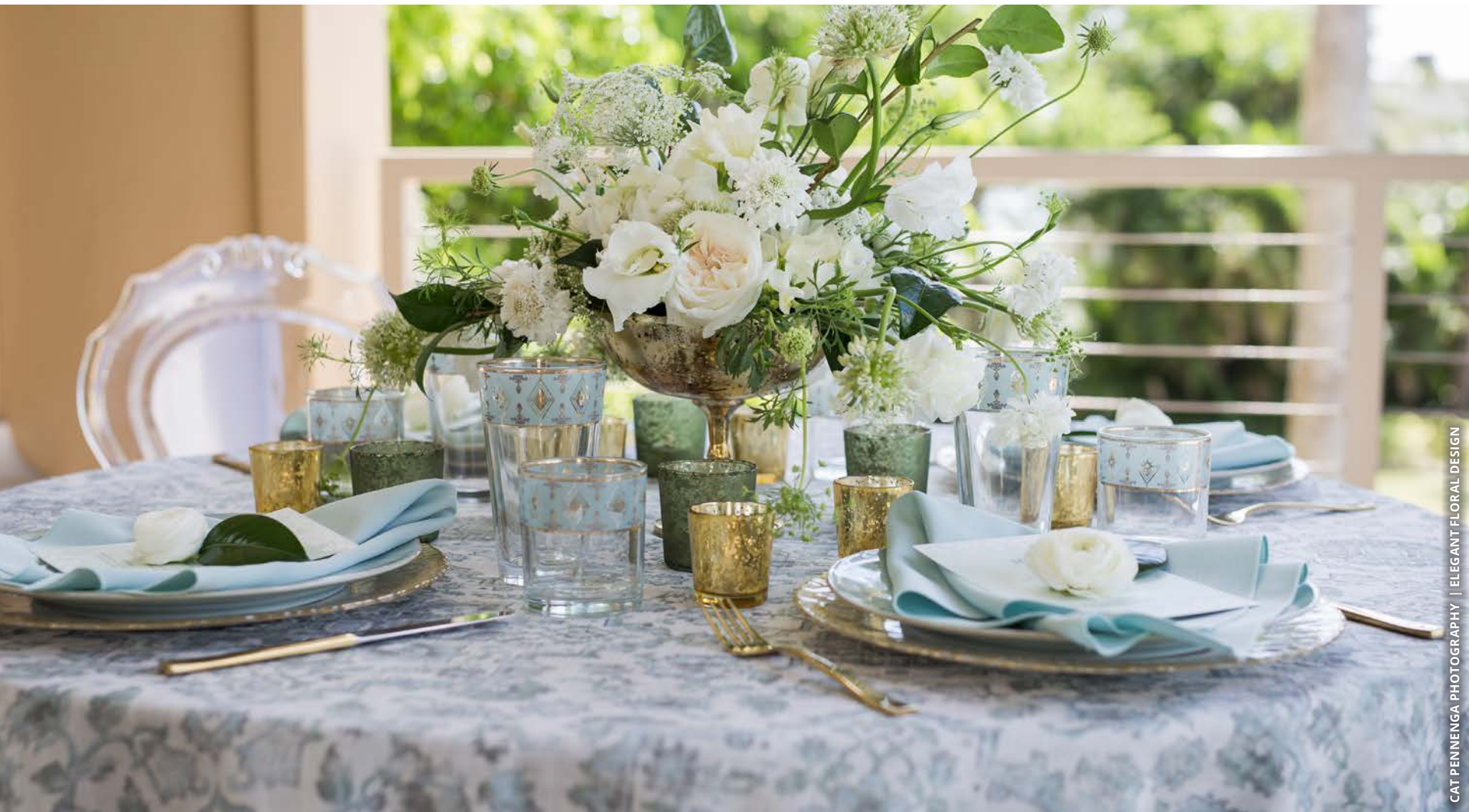
Verdigris Ezra Table Linen, Sea Glass Faille Napkin and Frost Gold Charger