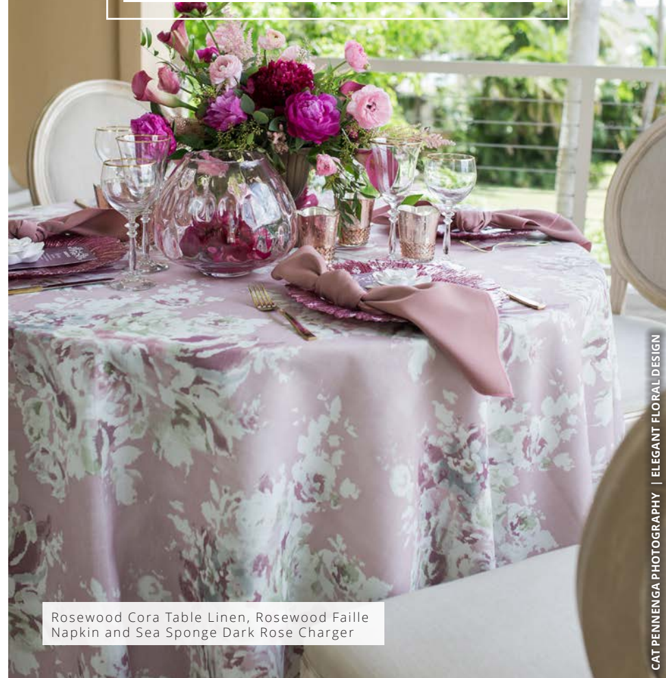
Rosewood Cora Table Linen, Rosewood Faillie Napkin and Sea Sponge Dark Rose Charger

Inspired by lush gardens, this soft floral pattern adds warmth. Pairing the large-scale print with upholstered chairs and gold accents enhances the comfortable feel. One can almost smell the garden roses.