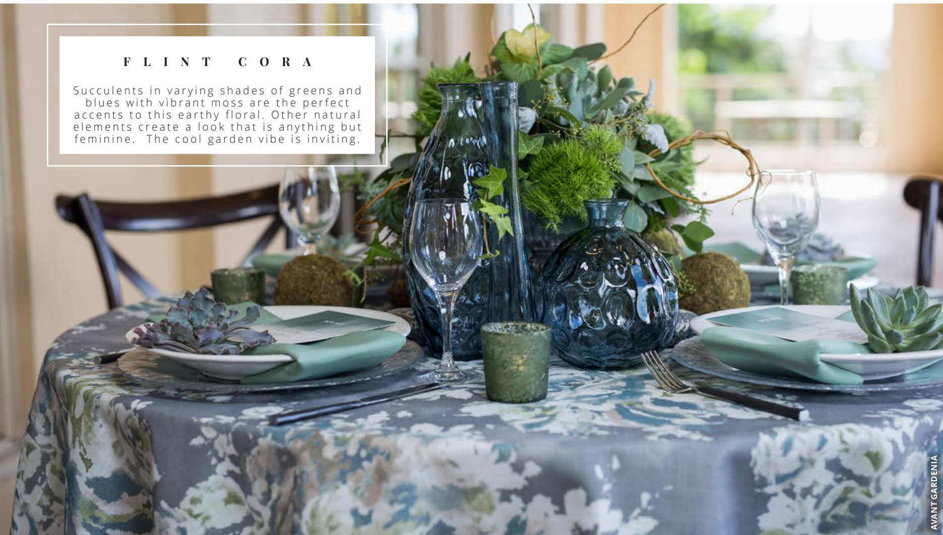
Flint Cora Table Linen, Basil Faille Napkin and Frost Silver Charger

Succulents in varying shades of greens and blues with vibrant moss are the perfect accents to this earthy floral. Other natural elements create a look that is anything but feminine. The cool garden vibe is inviting.