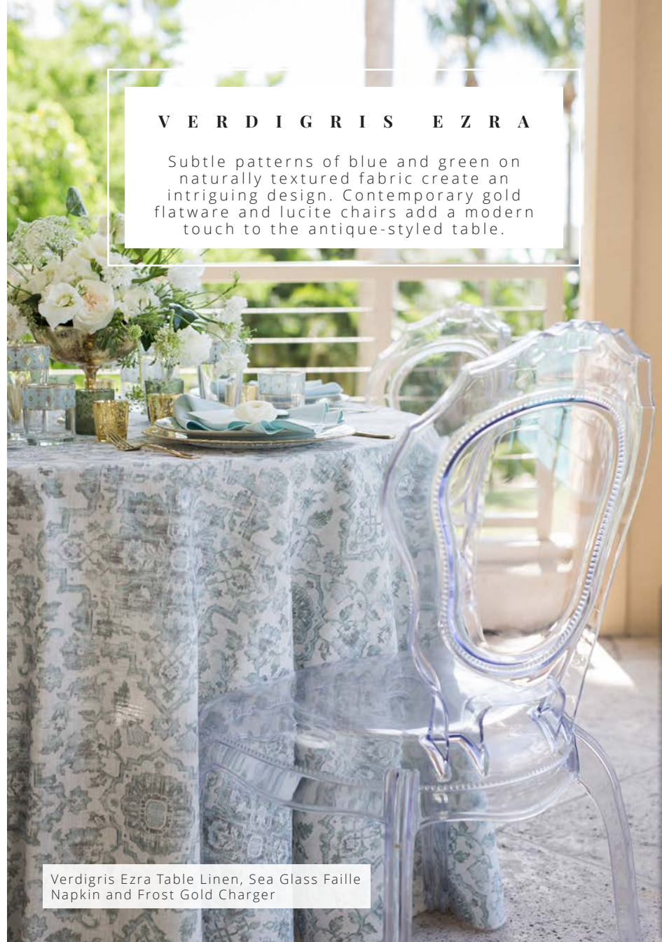
Verdigris Ezra Table Linen, Sea Glass Faillie Napkin and Frost Gold Charger

Subtle patterns of blue and green on naturally textured fabric create an intriguing design. Contemporary gold flatware and lucite chairs add a modern touch to the antique-styled table.