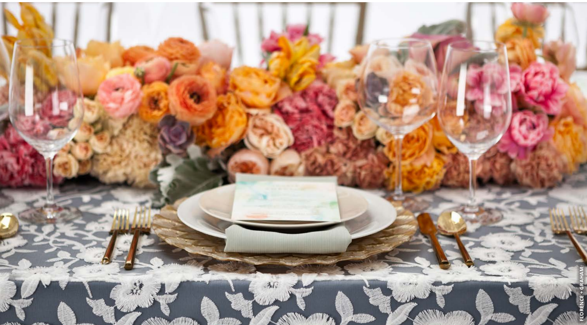
Blooming Lace Overlay, Slate Faille Table Linen, Succulent Faille Napkin and Florence Gold Cream Charger