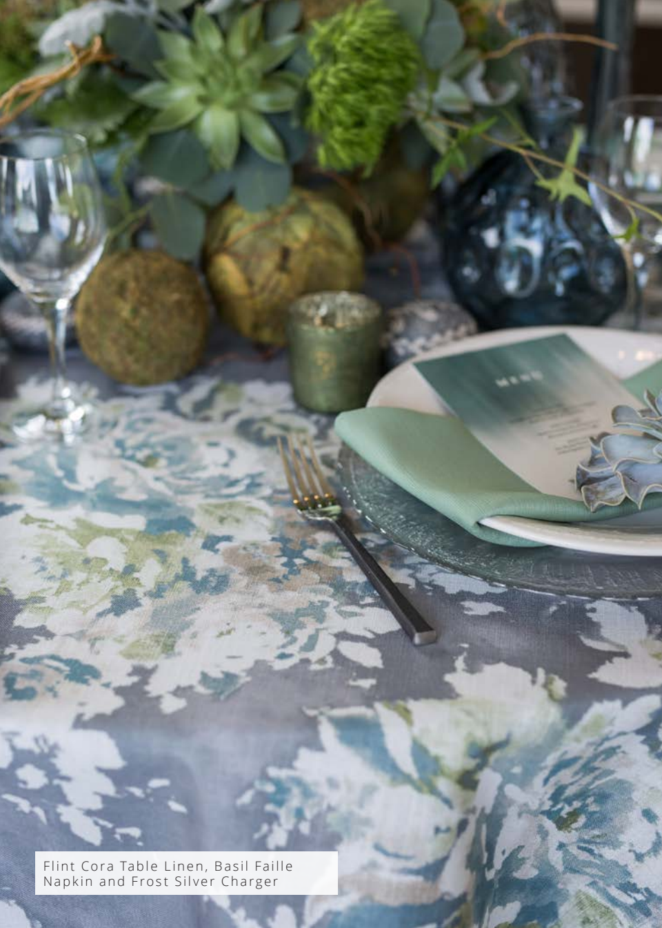
Flint Cora Table Linen, Basil Faille Napkin and Frost Silver Charger